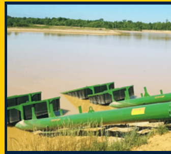
MINING AND CONSTRUCTION