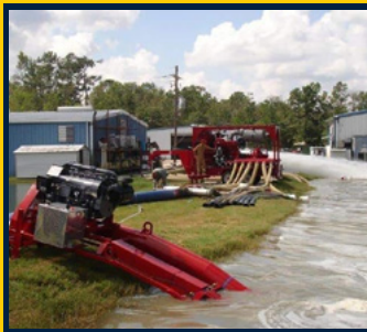
OIL FIELD, REFINERY, AND ENERGY