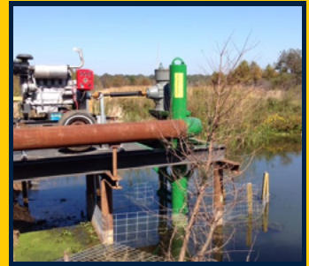
WATERFOWL AND WETLAND MANAGEMENT