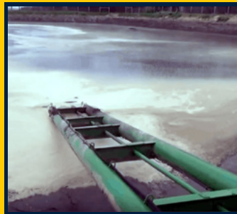
SLUDGE, SLURRY, & MANURE WASTE HANDLING