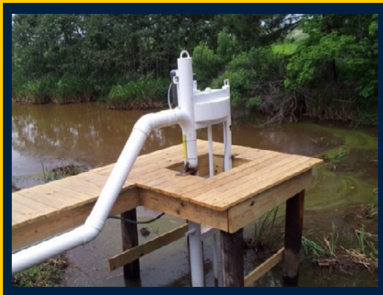
OUR 6" PUMP CAN TOLERATE 2" SOLIDS

GATOR Pumps are made to perform well in all kinds of environments. They can handle the toughest materials, including solids and thick fluids: