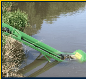
IRRIGATION AND AGRICULTURE

GATOR Pump offers dependable high-volume water and slurry pumps recognized industry-wide for their tough design, high performance, low operating cost, and easy maintenance. Our heavy-duty water and slurry pumps meet the demands of a breadth of industries, including but not limited to: