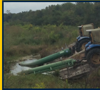
STORMS, FLOOD CONTROL, AND DRAINAGE